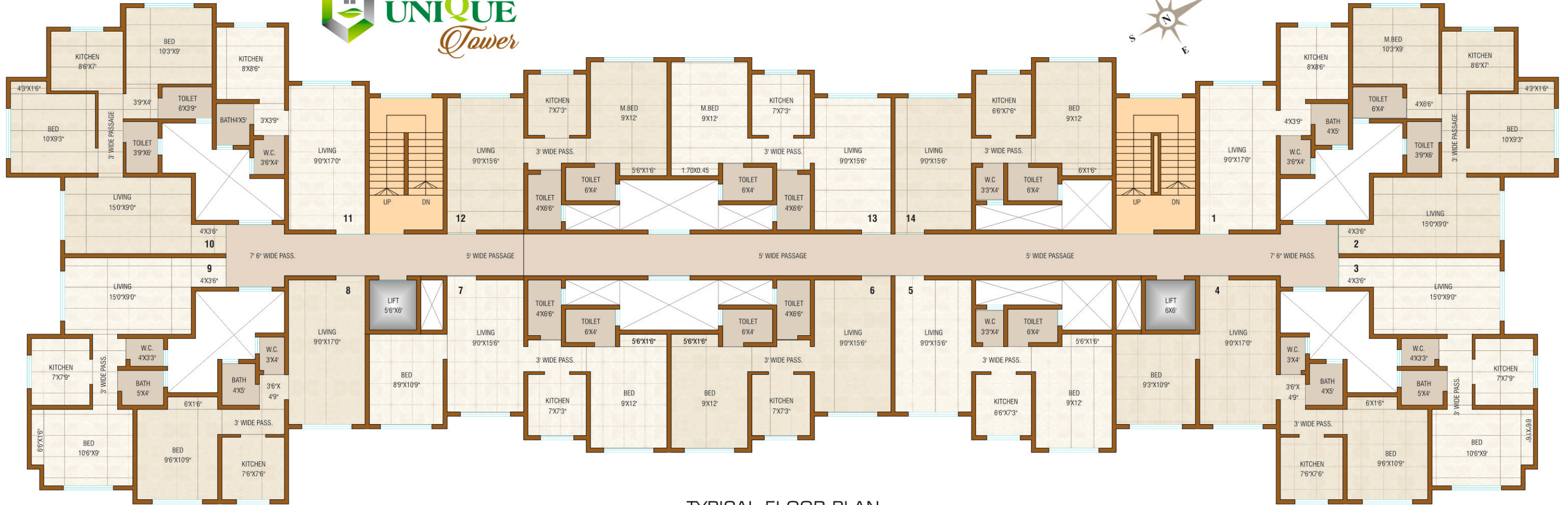
TYPICAL FLOOR PLAN 2nd to 7th Floor